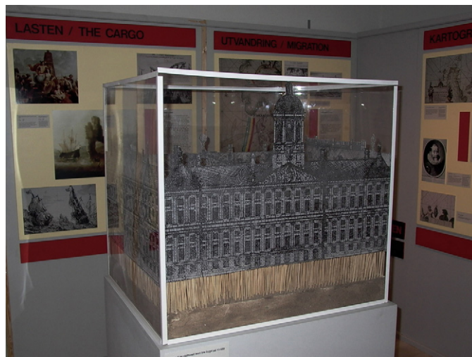
Fig. 2. Royal palace on Amsterdam Dam square.

Model: Museum of Flekkefjord, photo: Niels Bonde.